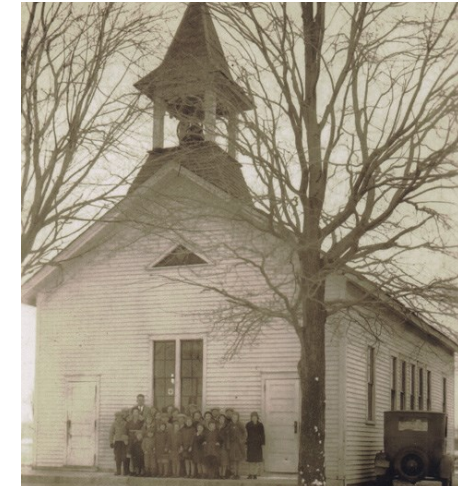
The East Crisp (Groenewoude School District 4) was built in 1860 on property donated by Groenewoude.

Rain, groundwater, rivers, and streams feed into Lake Michigan, dissolving naturally occurring minerals and sometimes picking up substances resulting from the presence of animals or from human activity. Some of the substances that can make their way into Lake Michigan are: viruses and bacteria from animal, agricultural, and human activities, salts, metals, pesticides and herbicides, as well as by-products of industrial processes. In order to ensure that tap water is safe to drink, EPA prescribes regulations, called Maximum Contaminant Levels (MCLs) that limit the amount of certain contaminants in your drinking water. Our water source has a moderately high susceptibility to contaminants.